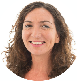
Miss Asansi PPA cover