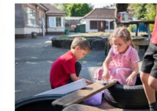
How to help with the wider curriculum

You can also find information about how to help your child .