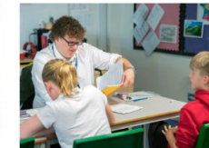
How to help with phonics