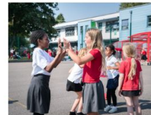
Black Lives Matter

Find out more about how you can help your child at home by clicking the links below.