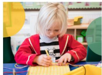
Design & technology