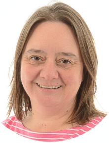
Mrs French PPA cover