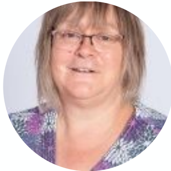
Miss Holden PPA cover