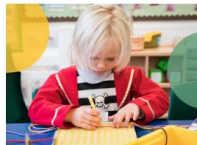
Design & technology