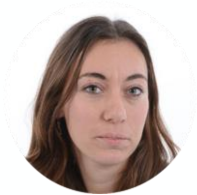
Miss Ash PPA cover & LSA