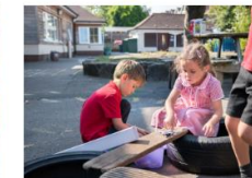
How to help with the wider curriculum

You can also find information about how to help your child .