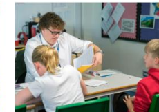
How to help with phonics