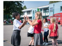
Black Lives Matter

Find out more about how you can help your child at home by clicking the links below.