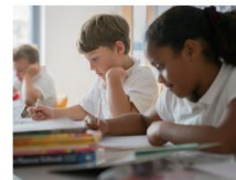
How to help with reading