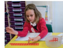
How to help with maths