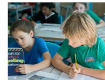
How to help with spelling