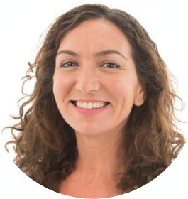
Miss Asansi PPA cover