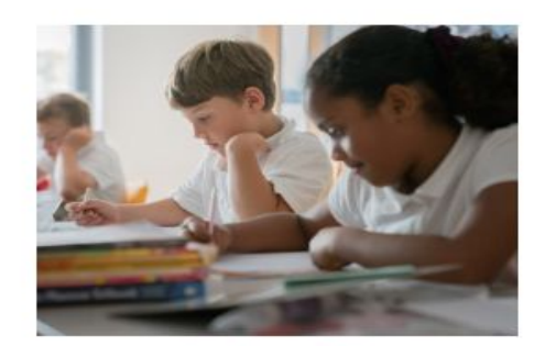
How to help with reading