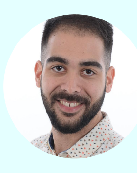
MR SUANES PPA cover