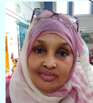
MISS NIMO KS1 LSA