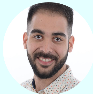
MR SUANES PPA cover