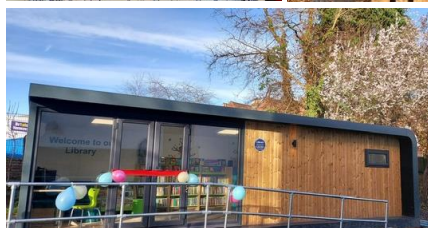
The new Myrtle library...