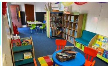
The new Merrywood library...